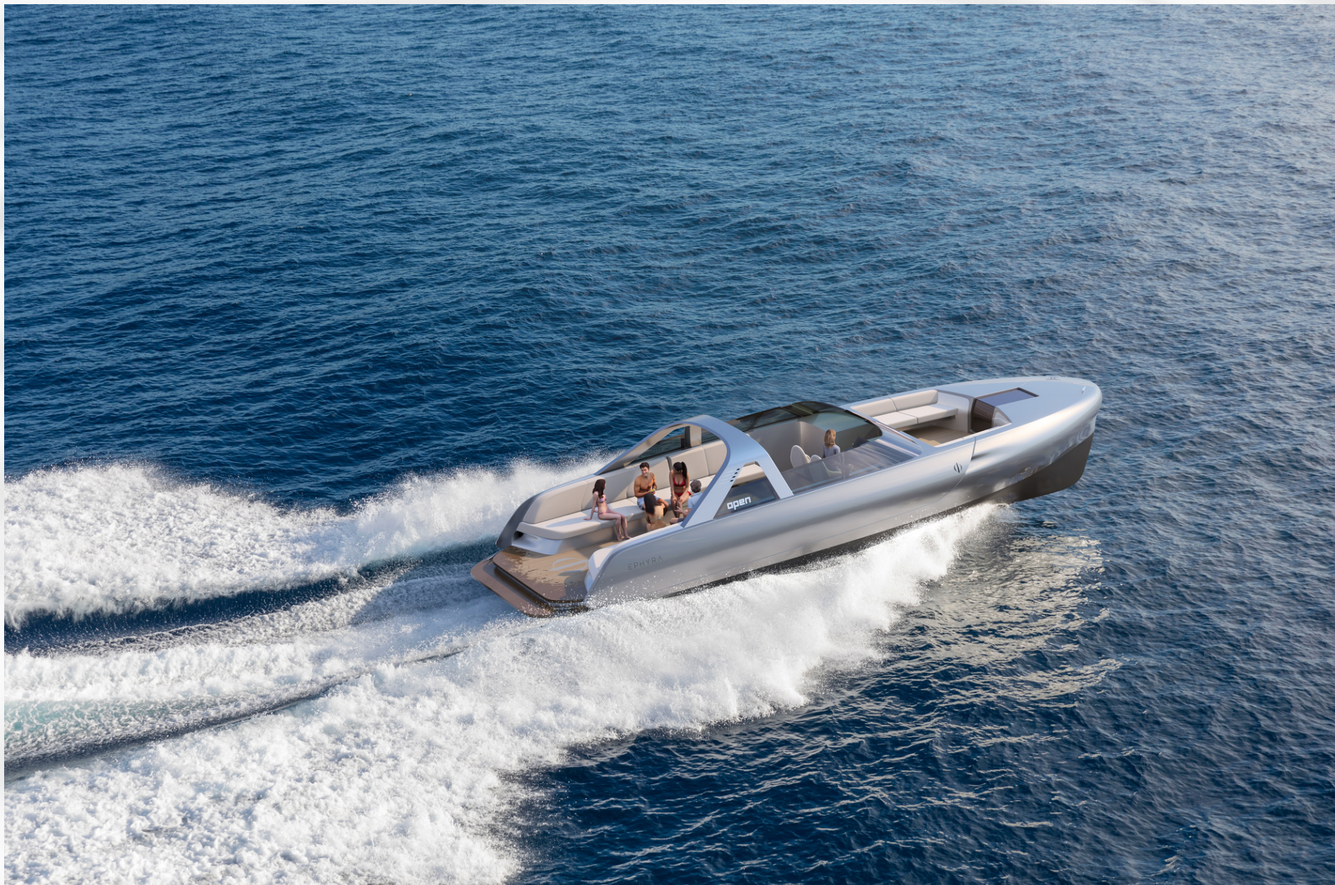
TYPE 48 OPEN