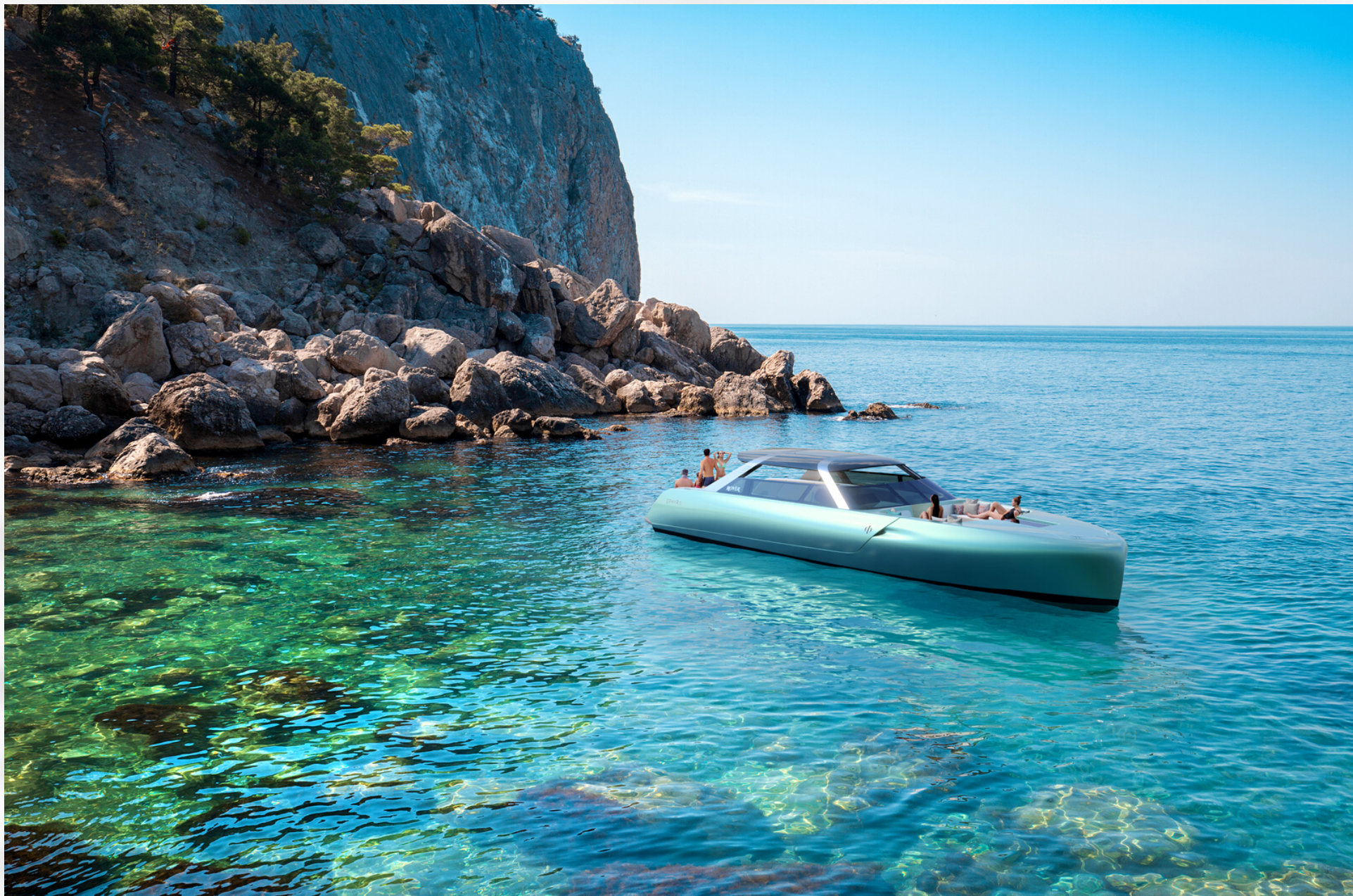
TYPE 48 ROVER