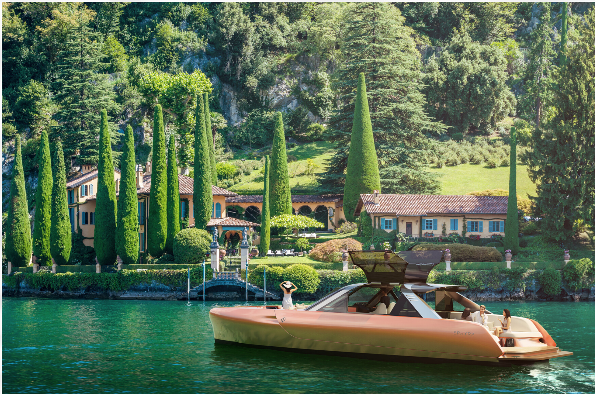
TYPE 48 LIMOUSINE